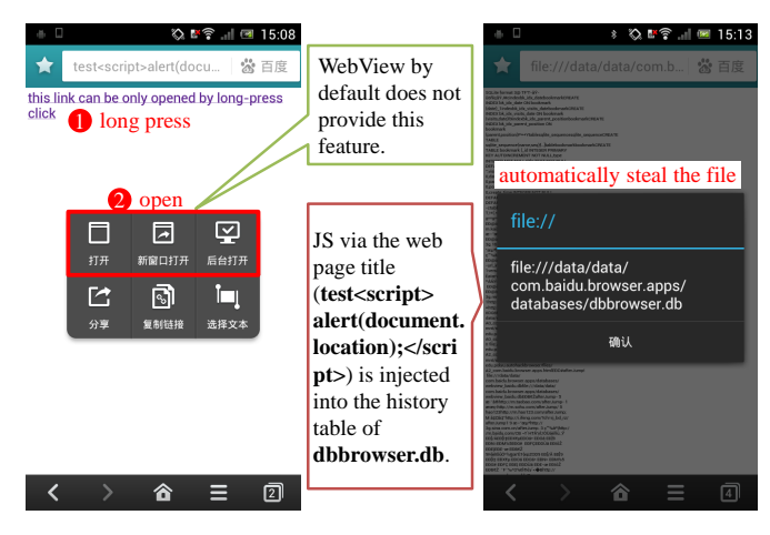
Fig. 3. An aimIFL-1 attack exploiting Baidu Browser.

could be exploited for future sopIFL attacks.